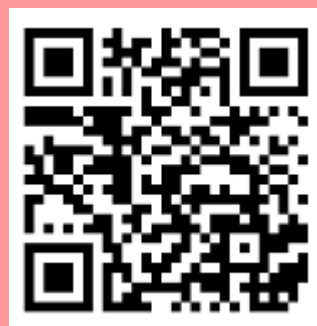
Sunday's Digital Bulletin