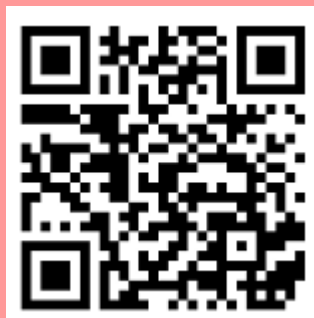
Sunday's Digital Bulletin